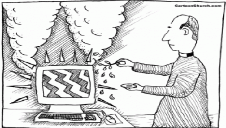
PERHAPS SPRINKLING WITH HOLY WATER WAS NOT THE BEST WAY TO LAUNCH THE CHURCH WEBSITE